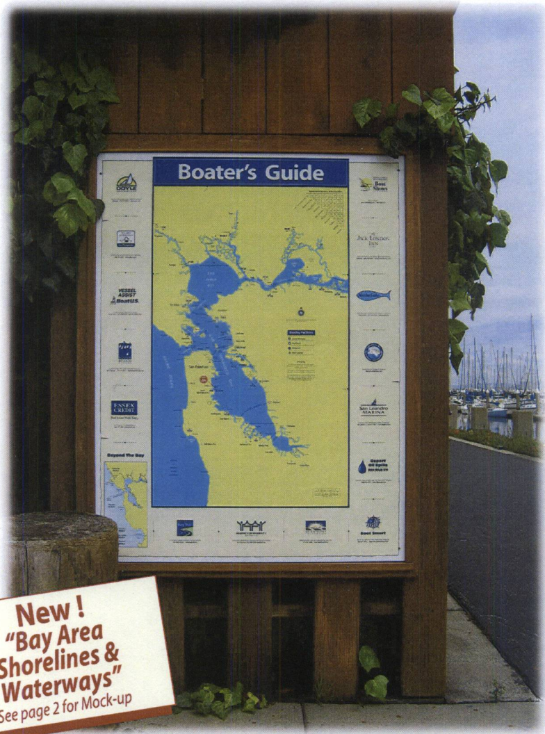
*See Page 2 for mock-up of new Shorelines & Waterways map