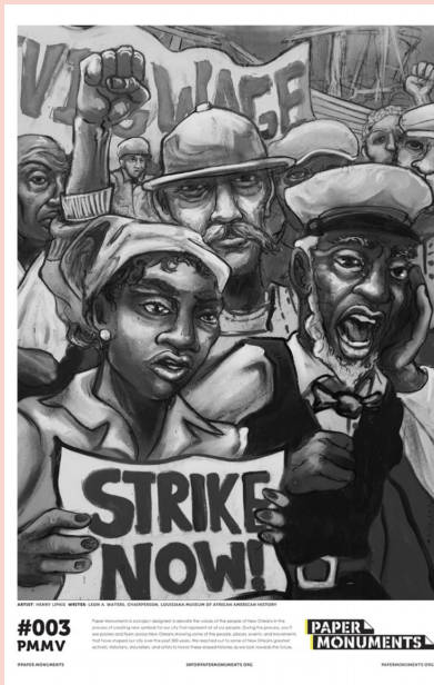
Example: History poster from Paper Monuments project, New Orleans

Made by participants in groups, facilitated by UC Berkeley and SJSU student artists.