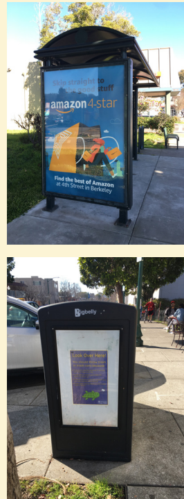
Examples of posters in bus shelter and trash can

On Solano Ave. and San Pablo Ave. bus shelters and Big Belly trash cans