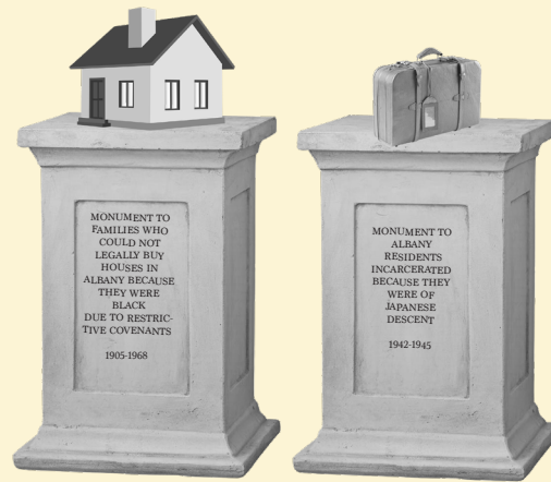
MONUMENT TO RACIAL COVENANTS