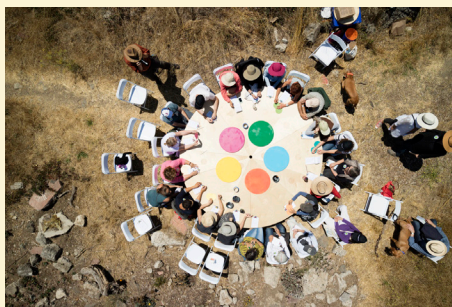
Example: Conversation table at Uncaptured Land, a social practice artwork by artists Carol Mancke and Trena Noval, curated by Susan Moffat.

8 Storytelling/history tables 8 Storytellers 40 community participants On the Ohlone Greenway Food