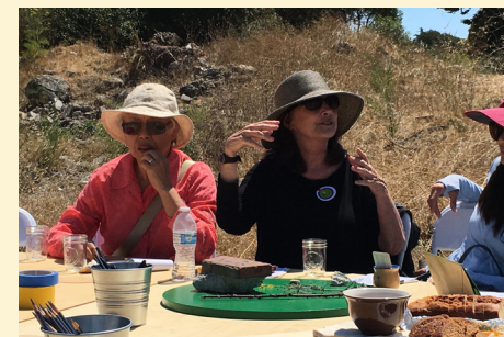
Example: Community conversation catalyzed by objects shared at Uncaptured Land.

Artist's book conversations 80 Chairs 80 community participants On the Ohlone Greenway (1 week after bookmaking)