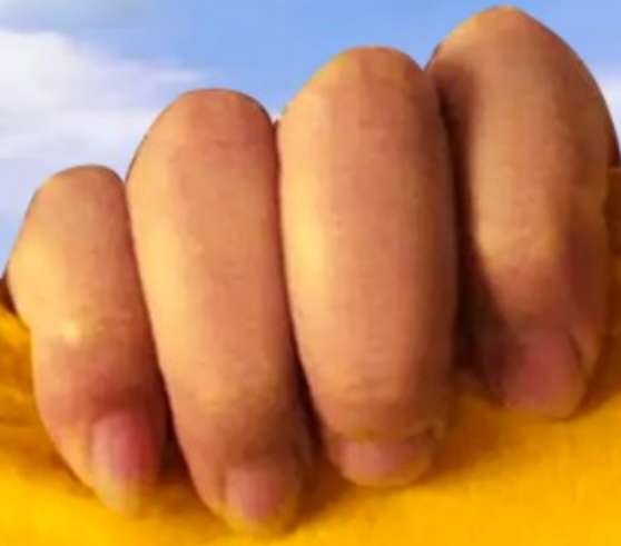
Shades of Ireland