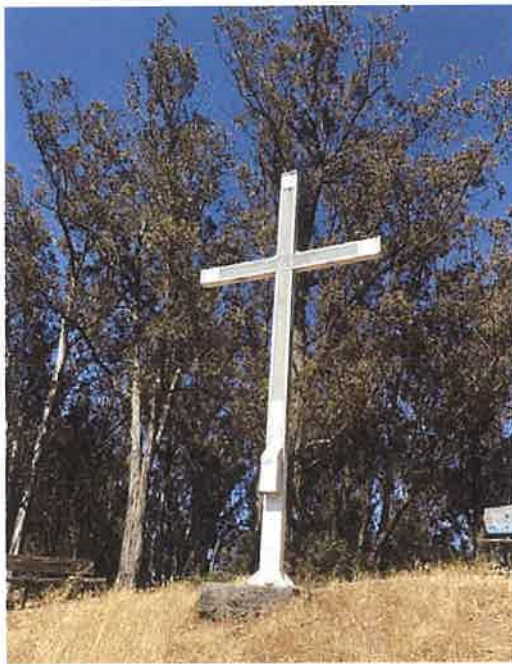
26 Front View From Off-Trail

11 With counsel for all parties, the undersigned judge conducted a view of Albany Hill 12 Park and the cross on June 5, 2018 (Dkt. No. 82). The following photographs were taken by his 13 law clerk: