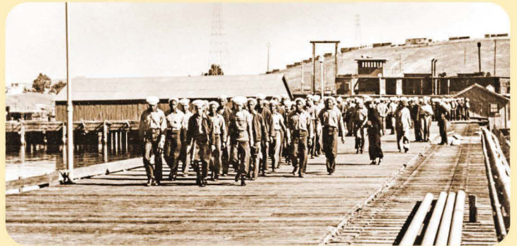
Port Chicago sailors

When ordered to return to loading ammunitions, over two hundred sailors refused to return to work due to the unsafe working conditions which resulted in the explosion. These sailors courageously advocated for safety for themselves and others in requesting adequate training and equipment before returning to work. In response, the Navy identified fifty Black sailors as the leadership of the organized action. The Navy charged these individuals with mutiny. This decision resulted in one of the most significant mutiny trials in U.S. military history. The fifty sailors were supported by then NAACP Chief Counsel Thurgood Marshall who through the press raised the racist nature of the