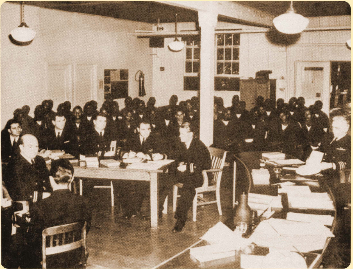
1944 mutiny trial of the Port Chicago 50