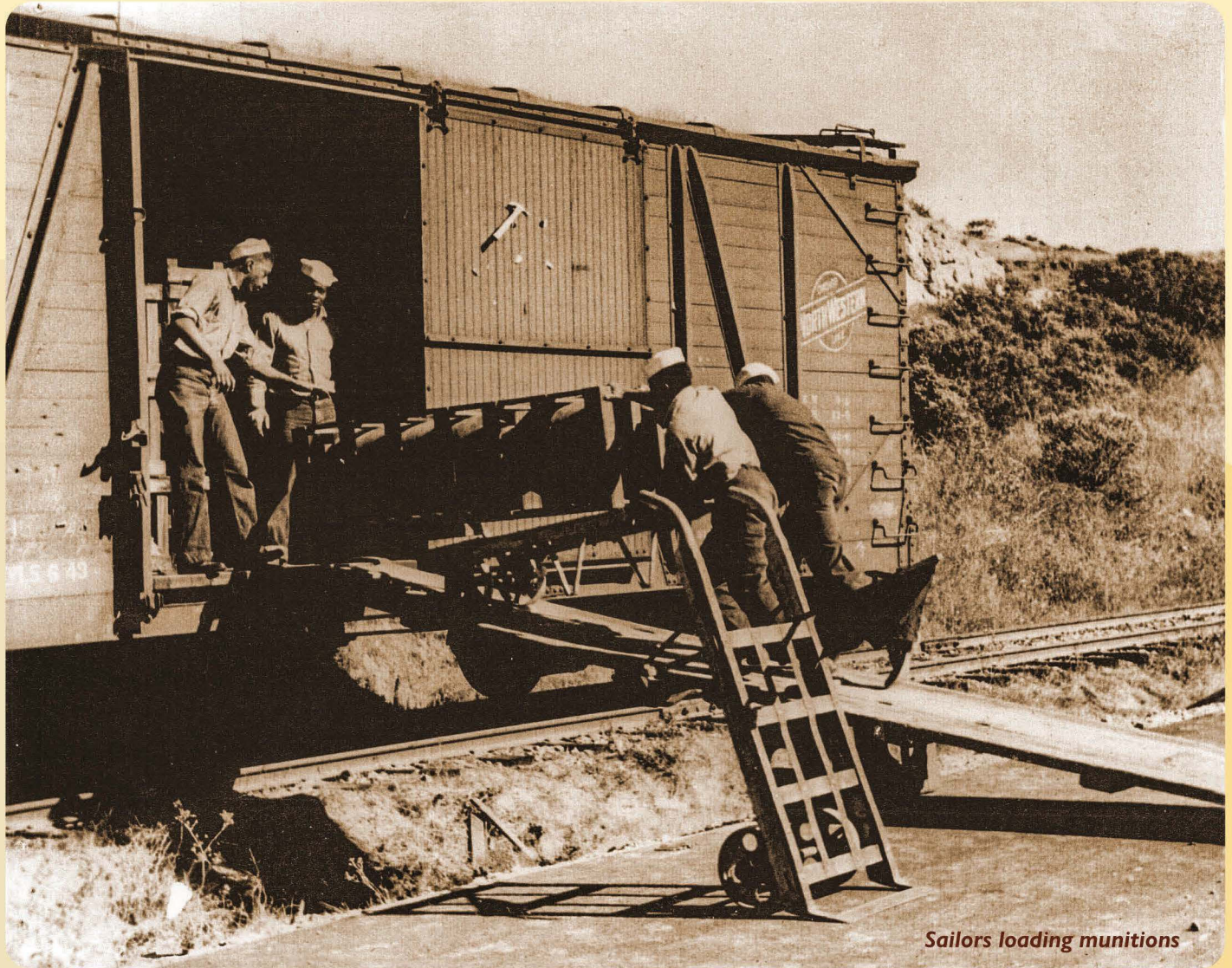
Sailors loading munitions

O n July 17, 1944, there was a large waterfront munitions explosion at the Port Chicago Naval Magazine in Concord, California which killed more than 320 sailors, over 200 of whom were Black. The explosion also injured 390 others, including 226 African American enlisted men. Prior to the explosion, these men were working significant hours with munitions continuously being loaded despite little to no training. This incident represents nearly