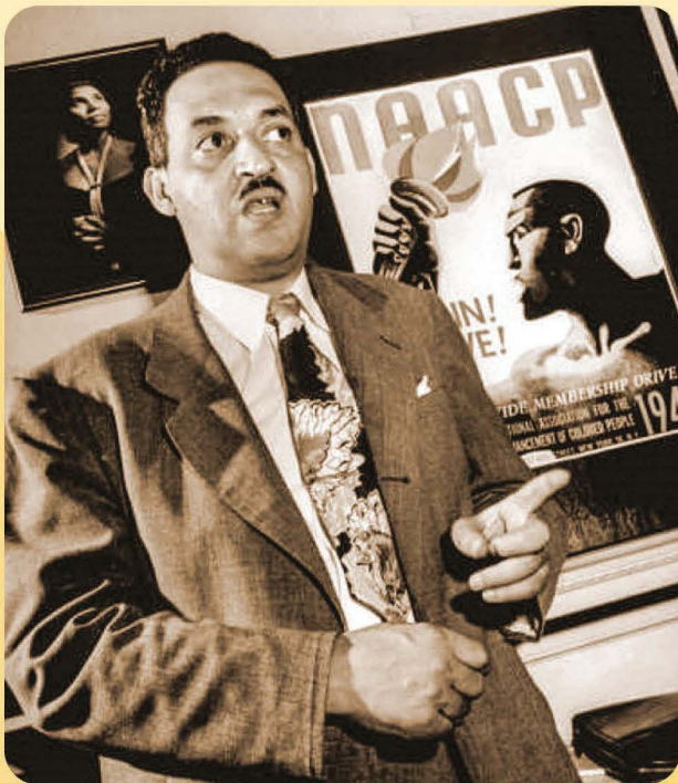
NAACP Chief Counsel Thurgood Marshall

“I do not take up cases unless I am convinced the men are innocent. I was never so convinced that the evidence was insufficient in a case as I was listening to that case... There is no sufficient evidence of mutiny or conspiracy. These men are being tried for mutiny solely because of their race.”