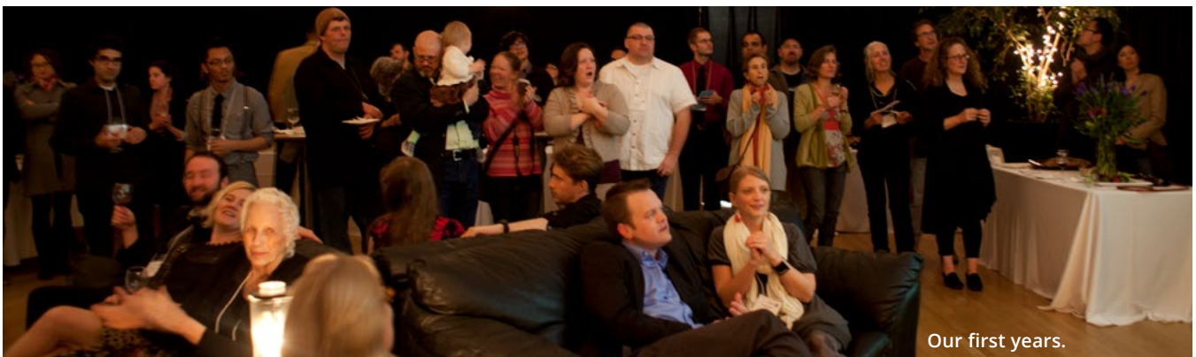
Our first years.