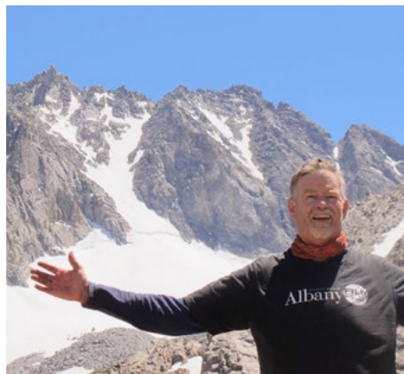
and in Argentina