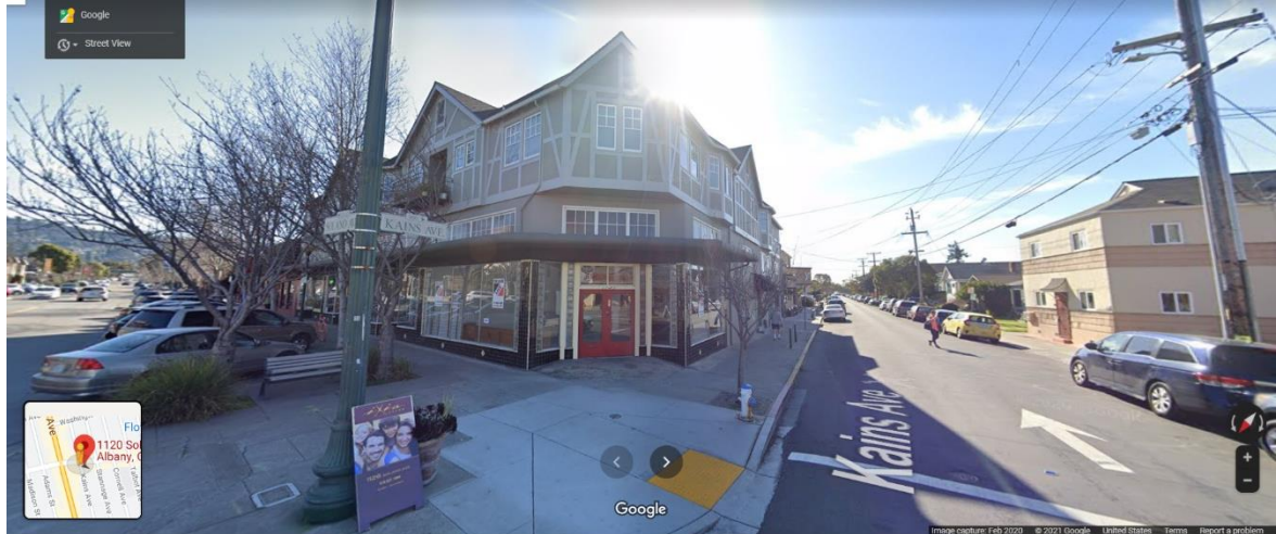
Image 1. Business Location