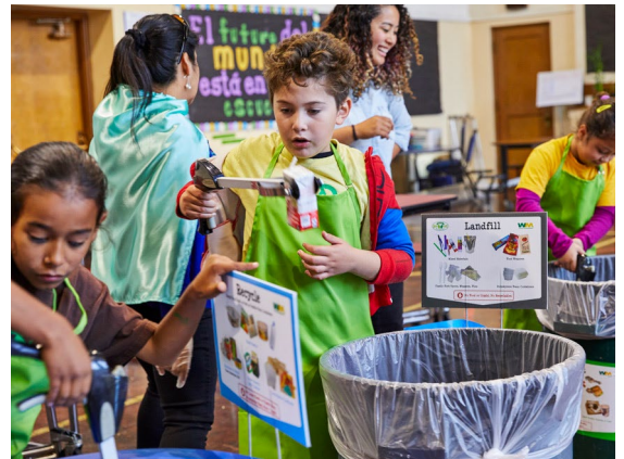
StopWaste works with school Green Teams to help their classmates sort properly at lunch.

Stakeholders, including district sustainability coordinators, teachers, and parents, are provided ongoing environmental education and technical assistance.