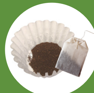
Coffee grounds & tea bags