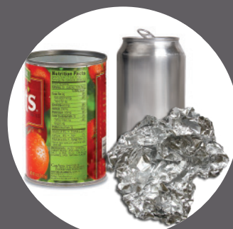
Cans, foil, & scrap metal