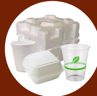
Polystyrene foam, plastics labeled "compostable"