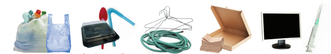
Plastic bags (do not bag recyclables)