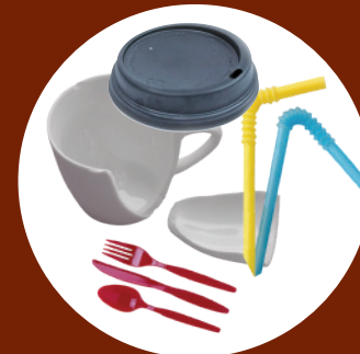
Broken glassware & ceramics, plastic straws, lids & utensils (Reusable items should be donated)