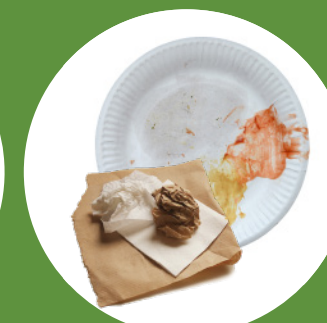
All unlined food-soiled paper