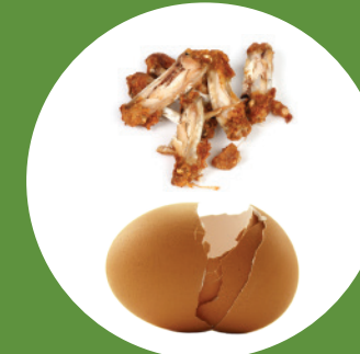
Bones & shells