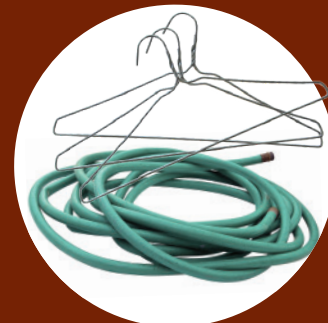
Hoses & wires