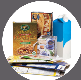
Paper packaging & paper cartons