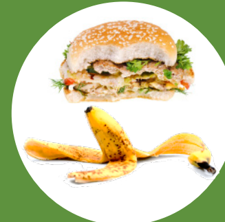
All food waste, peels, pits, & cores

(Even if it is labeled "compostable" or "biodegradable")