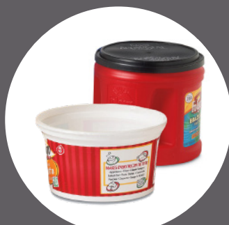
Rigid plastic containers