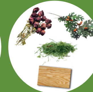
Plant debris & clean wood