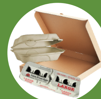
Unlined paper take-out & pizza boxes, egg cartons