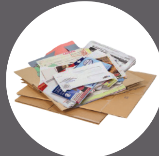
Clean paper & cardboard (please break down)

Contaminants can ruin an entire load of recyclables