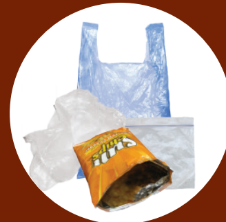
Loose plastic bags & wrap, snack bags