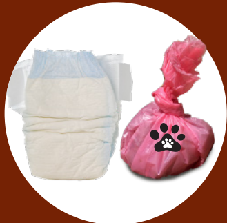
Diapers & pet waste