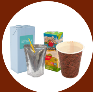
Drink & food cartons, boxes / pouches, lined paper products

Eliminate single-use plastic by using reusable bags and containers