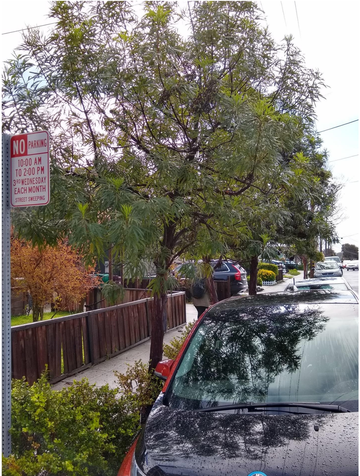
821 Cornell (tree to the left/north side of property)