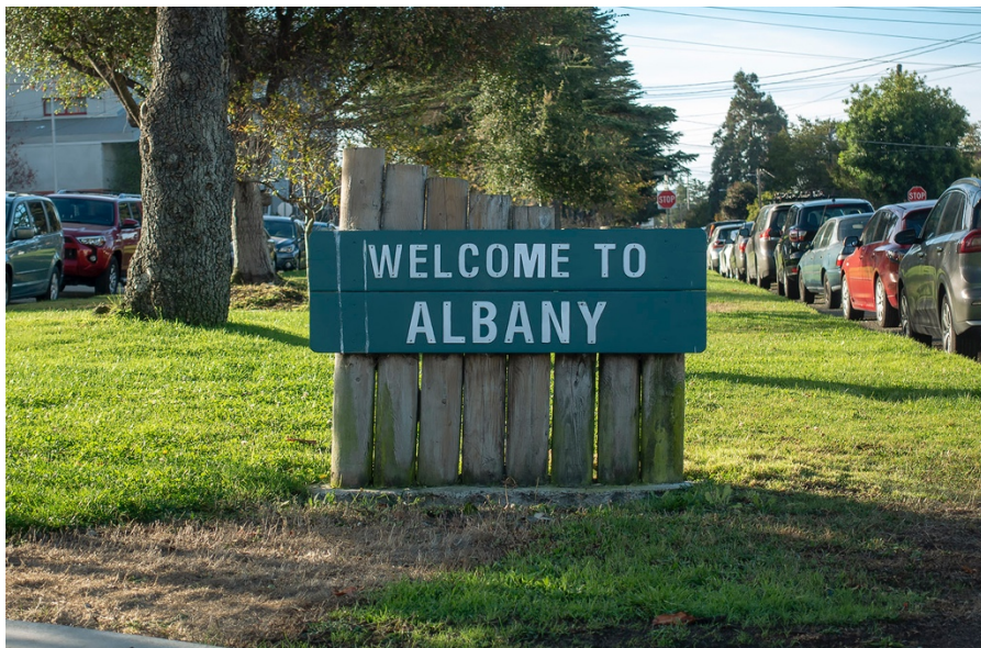
Figure 2: Existing Sign

Currently, the sign is in fairly poor condition, as some of the posts are insecure and the footing is rising. Last year, Doug Donaldson repaired a missing letter and re-painted the green signboard, but now ACF would like to propose replacement of the entire sign.