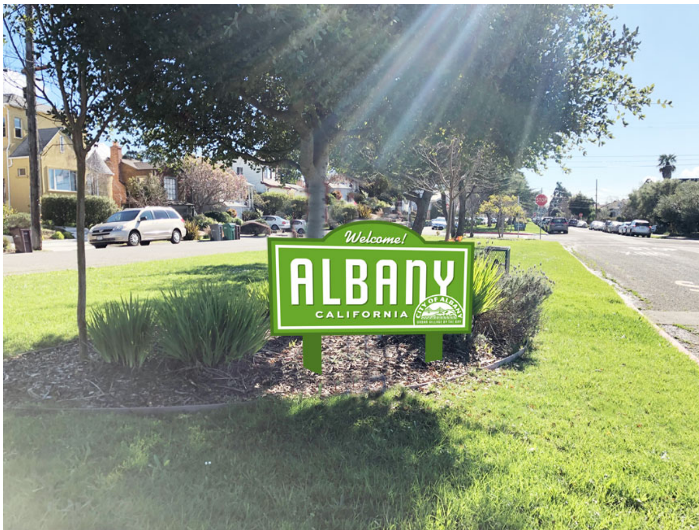
Figure 3: Proposed sign design and placement

Proposal Part 2 – A New Location: The ACF Board notes that the existing sign is located at the Brighton Avenue intersection, not very close to the actual Albany border. If located closer to the city limits, the sign would be somewhat more visible than at the existing location, and outside of the intersection’s driving and viewing distractions. The adjoining photosimulation shows the sign installed at a suitable location several hundred feet north of the intersection, where the sign can be erected inside a planting bed (avoiding lawnmowers) and canted at an angle that would provide good visibility from vehicles entering Albany on Key Route Boulevard.