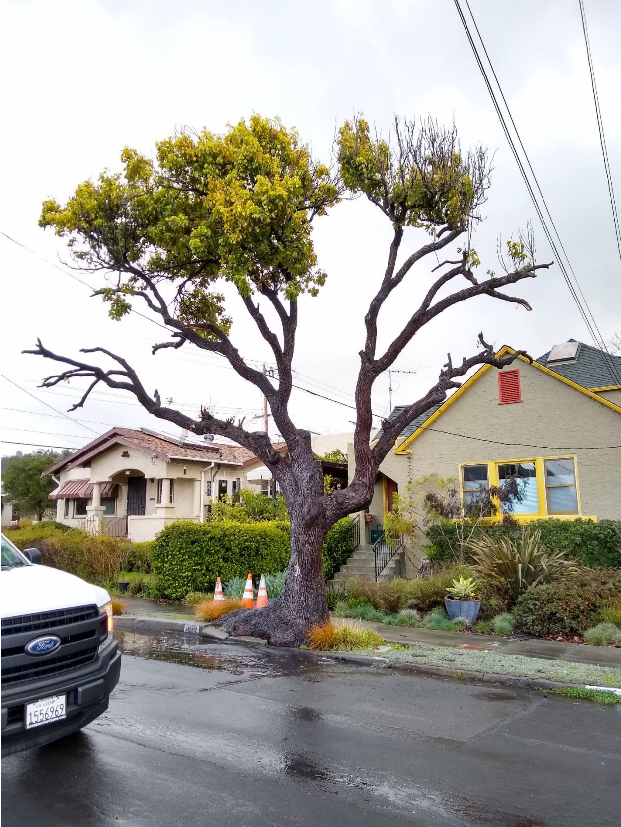
605 San Carlos