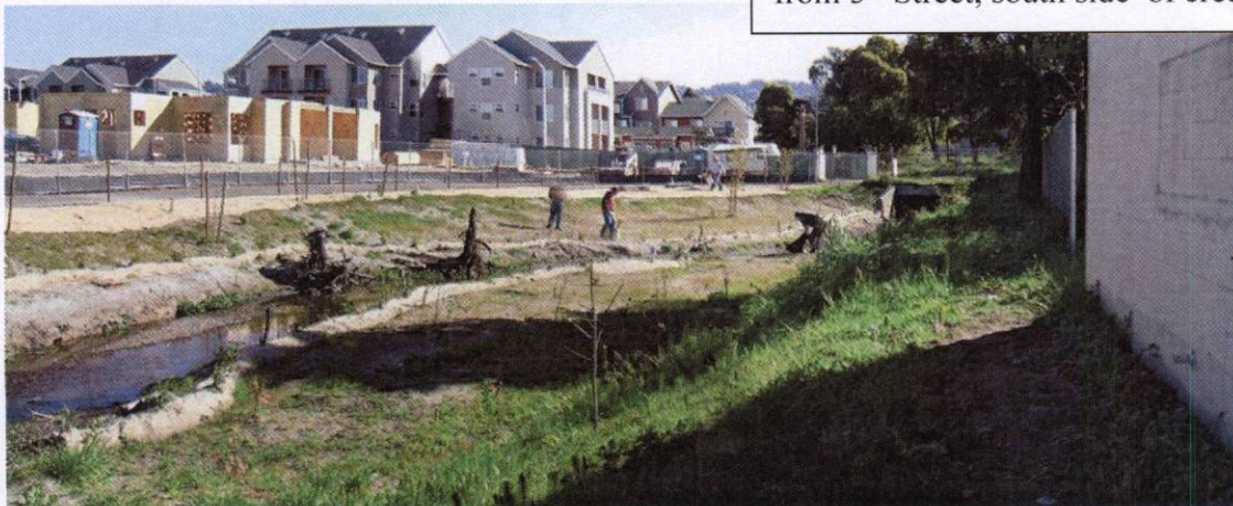
Below: Looking easterly to 6 th Street from 5 th Street, south side of creek.