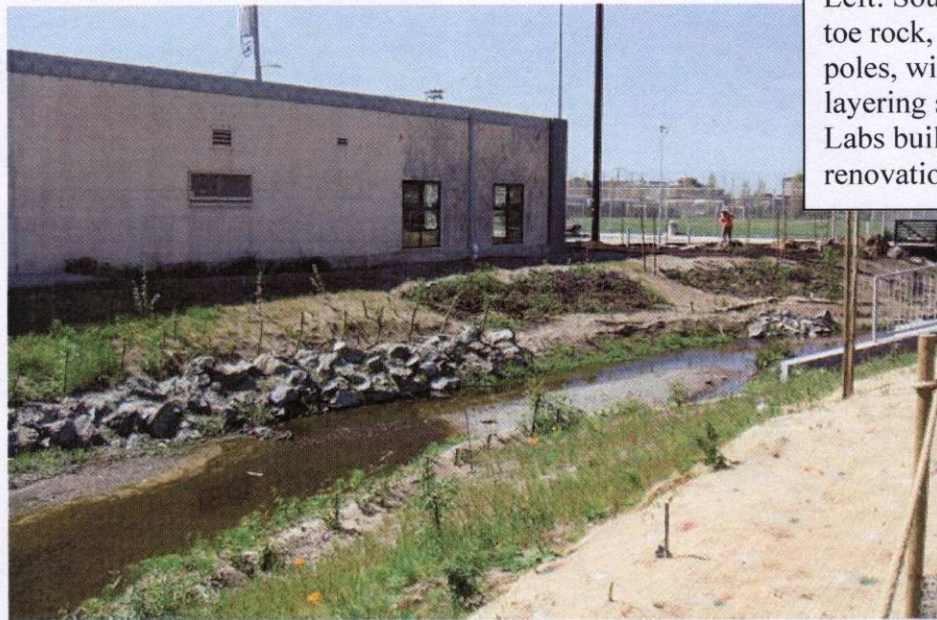
Left: Southwesterly view, toe rock, live willow poles, willow brush layering sprouting, Bryant Labs building under renovation in background