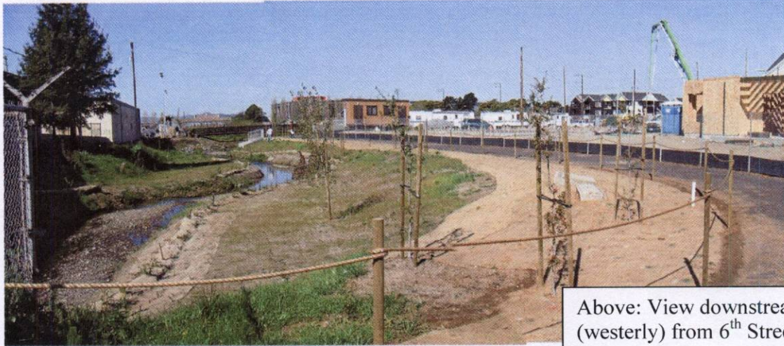
Above: View downstream (westerly) from 6 th Street.