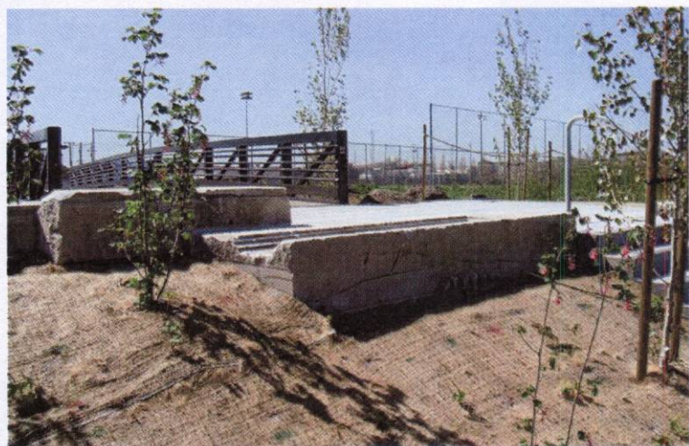
Right: View southwesterly at the North landing of the Phase II 5 th Street bridge; “found” granite blocks, steps down to Fielding East ball field.