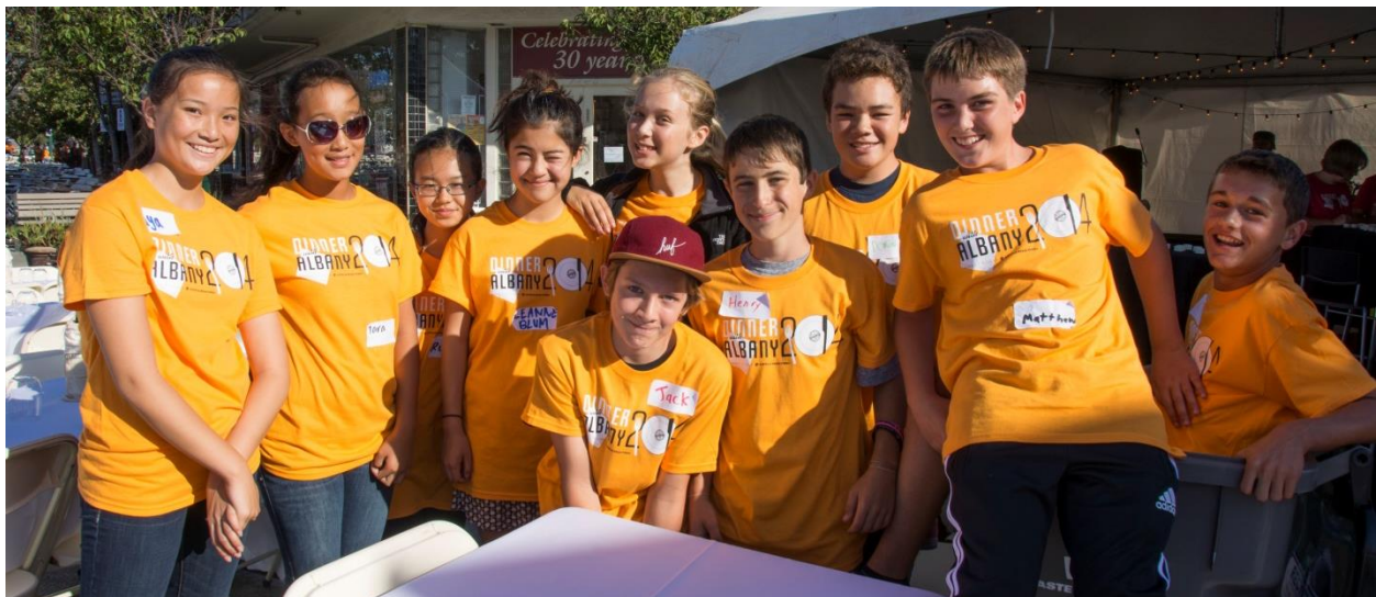
Teens prepare for Dinner with Albany, 2014

See policies under Goal 5 for references to the School District's role as a partner in the delivery of recreational services and programs.