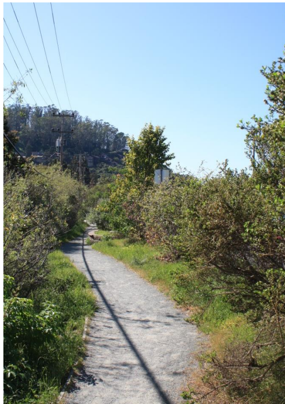
Cerrito Creek Trail

Other planned improvements include the extension of trails along Cerrito and Codornices Creeks. Opportunities for such trails exist west of San Pablo Avenue, where much of the land on the Albany side of the creek is already in public ownership. The planned senior housing development at University Village will include trail improvements along Codornices Creek, linking San Pablo Avenue to the existing trail further west. There is also a potential to improve the trail system along Cerrito Creek within Creekside Park, and to the east near El Cerrito Plaza. Opportunities for creekside trails are much more limited elsewhere along these creeks, since they are located in private backyards.