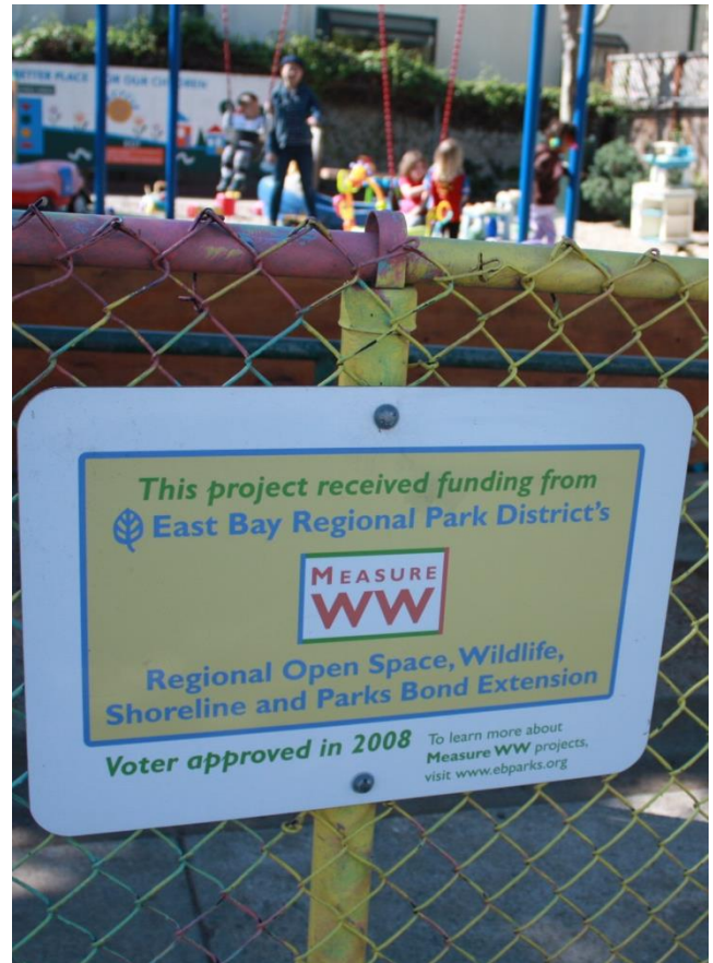
Dartmouth Mini Park

Work with Caltrans, Union Pacific Railroad, and other parties to explore enhancement of the underutilized open space along Interstate 80, particularly on the east side of the freeway at the Buchanan Street interchange. Use of this space for landscaping, gateway signage, public art, stormwater management, and similar improvements should be considered.