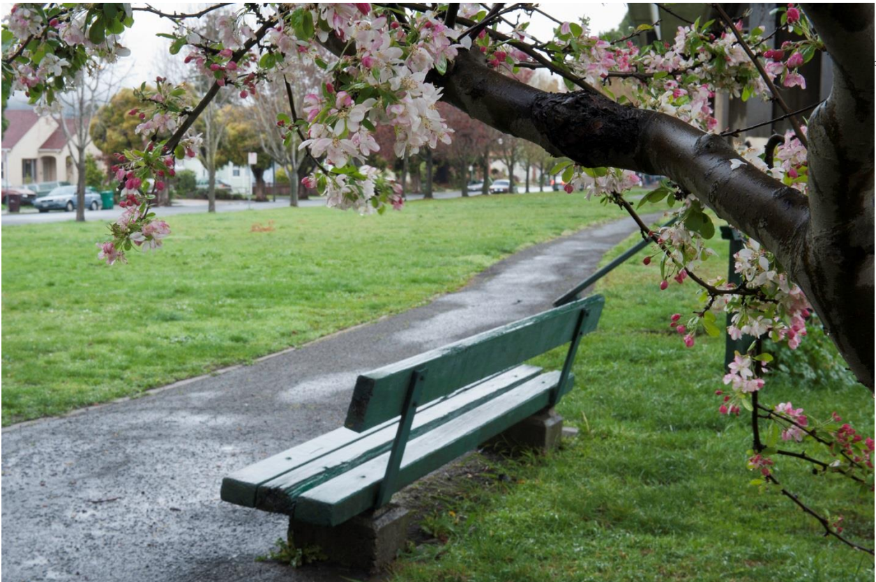
Ohlone Greenway near Codornices Creek

Per capita acreage standards are supplemented by distance standards (in other words, the distance a resident has to walk, bike, or drive to reach a park) and standards for specific types of facilities. The National Recreation and Park Association (NRPA) has a guideline that all residents should be within \frac{1}{2} mile of a neighborhood (or community) park. Some parts of Albany do not meet this standard, including the high-density areas along Pierce Street and the east side of Albany Hill. Construction of the new Pierce Street Park should address this deficiency.