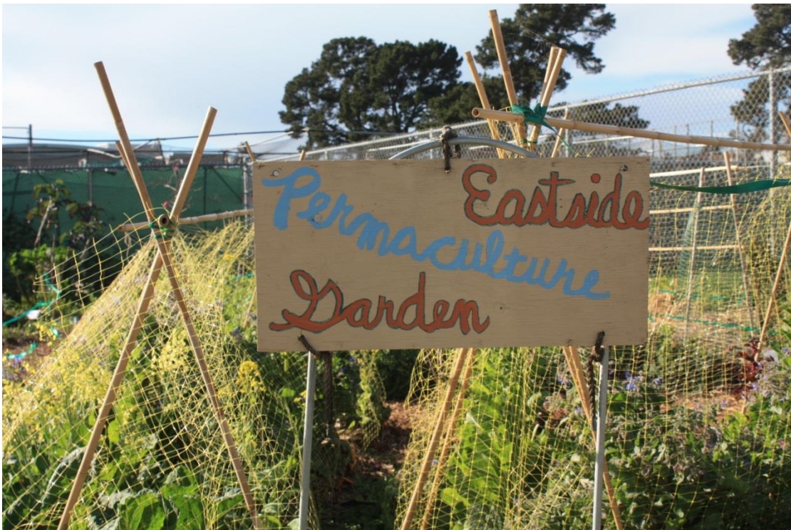
Eastside Permaculture Garden in Memorial Park

In addition to the open spaces described above, most residential properties in Albany include front yards, back yards, and side yards. Collectively, these spaces create a sense of spaciousness, provide access to sunlight, and support habitat for birds and other wildlife. Landscaped roadway medians, rights-of-way, and areas around public buildings also are part of the open space network. Streets themselves provide another form of open space and present opportunities for greening, stormwater management, community gatherings, and certain forms of active and passive recreation. Open spaces also may include rooftop gardens, urban plazas, schoolyards, courtyards, and other outdoor activity areas.