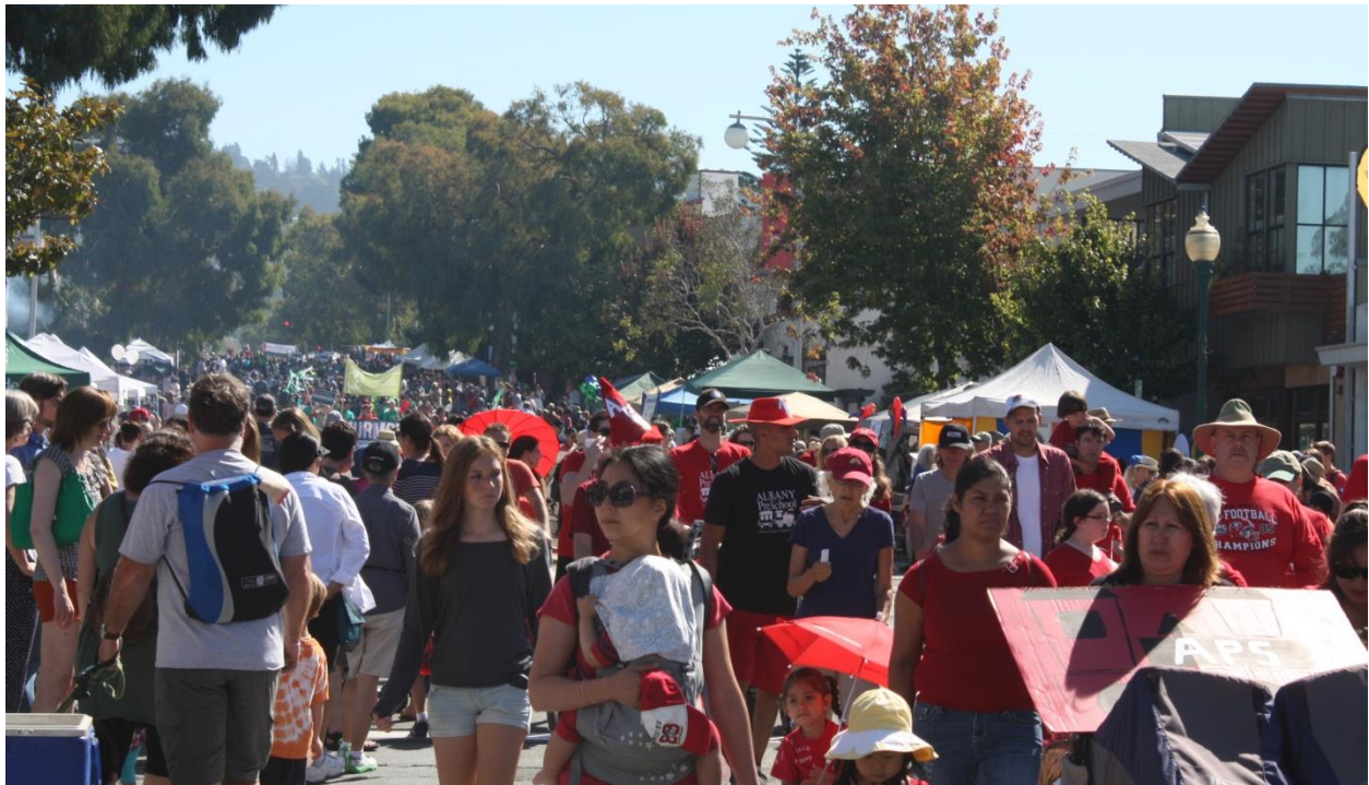
Solano Stroll Street Fair

The State General Plan Guidelines recommend that general plans be updated every five to ten years to ensure that they remain relevant. Periodic updates are important to incorporate current data and forecasts, and to reflect emerging issues and state mandates. Updates also ensure that the plan provides a framework for future area plans, specific plans, and plans for infrastructure and public services.