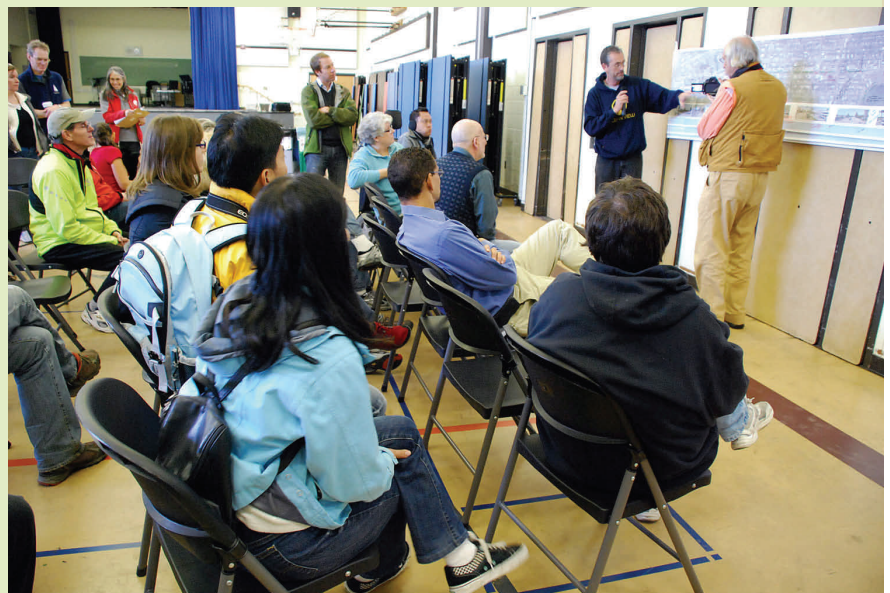
Traffic & Safety Commission Public Workshop

Interested in serving on an Advisory Body to the City Council? Applications are now being accepted - complete the application online.