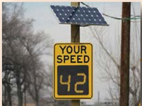
Install speed feedback solar sign