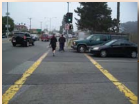
Restripe existing crosswalks