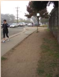
Replace and widen sidewalk adjacent to school on Jackson Street (not included in the current grant application)