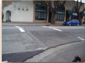
Stripe crosswalks (white)