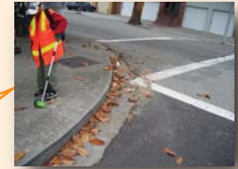
Reconfigure existing curbramps to comply with ADA requirements