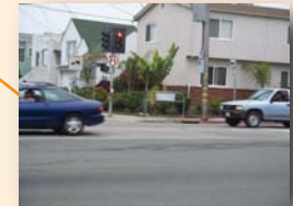
Replace existing signal: - protected north-south left turn phase - pedestrian countdown signal