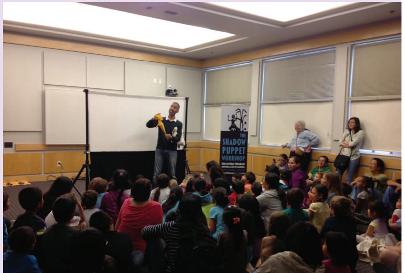
Summer Children's Program

Greetings from Libraryland! This is our very first column and we are excited to have a monthly spot in Albany's Official eNewsletter. The Summer Reading Game was a great time had by all. By Game's end, 730 people signed up. Nearly 400 won the first prize and 200 won the second. Families came for our various summer programs. The Tuesday Night crowds had a ball watching science come to life, marionettes and shadow puppets, snakes, dogs, didgeridoos, jugglers and magicians--topped off with gifted kids who took the stage for our annual summer Talent Show. There were ten programs in all, sponsored by Friends of the Albany Library ( Thank you, Friends. We couldn't do it with you! ). The performances drew audiences between 60 and 150 people each. We thank all the families from Albany and surrounding towns who made the Library a summer destination.