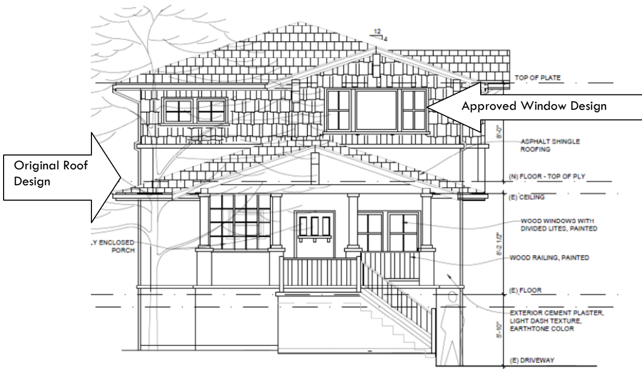
Image 1. Original Approval from 11/28/12