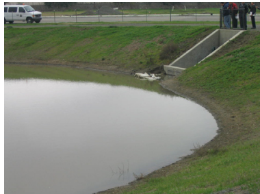
Detention pond provides stormwater treatment and hydromodification management.

and/or rainwater harvesting and reuse, if feasible. More information is provided in a flyer on stormwater quality requirements (see “For More Information”). Integrating these low impact development (LID) designs into the site plan helps reduce changes in the site's hydrology. For projects in which it is feasible to meet stormwater treatment requirements with infiltration, evapotranspiration, and/or rainwater harvesting, it may be possible to design smaller flow duration control facilities.