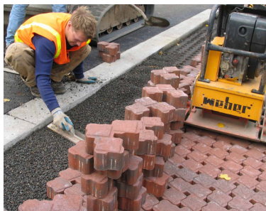
Ungrouted modular pavers are an example of a hydrologic source control.

Flow duration controls are designed so that the post-project stormwater discharge rates and durations match the pre-project rates and durations from 10 percent of the pre-project 2-year peak flow up to the pre-project 10-year flow. Projects that require flow duration controls typically also require water quality treatment controls (see flyer on stormwater quality requirements, referenced under “For More Information”). If feasible, combining flow duration and water quality treatment into one facility will reduce the land area needed for stormwater management.