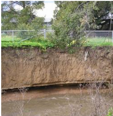
Example of creek bank erosion

When undeveloped land is covered with buildings and pavement, it causes more stormwater runoff to flow into creeks at faster rates. This may result in creek channel erosion, as well as flooding, habitat loss, and, in some cases, property damage. These development-induced changes to the natural hydrological processes and runoff characteristics are called hydromodification.