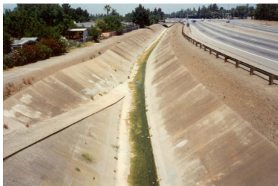
Example of an engineered channel

In the past, creek bank erosion was addressed by constructing engineered channels. But this created new problems for salmon and other migratory fish, and in some locations resulted in excessive sedimentation in the channels, requiring costly maintenance.