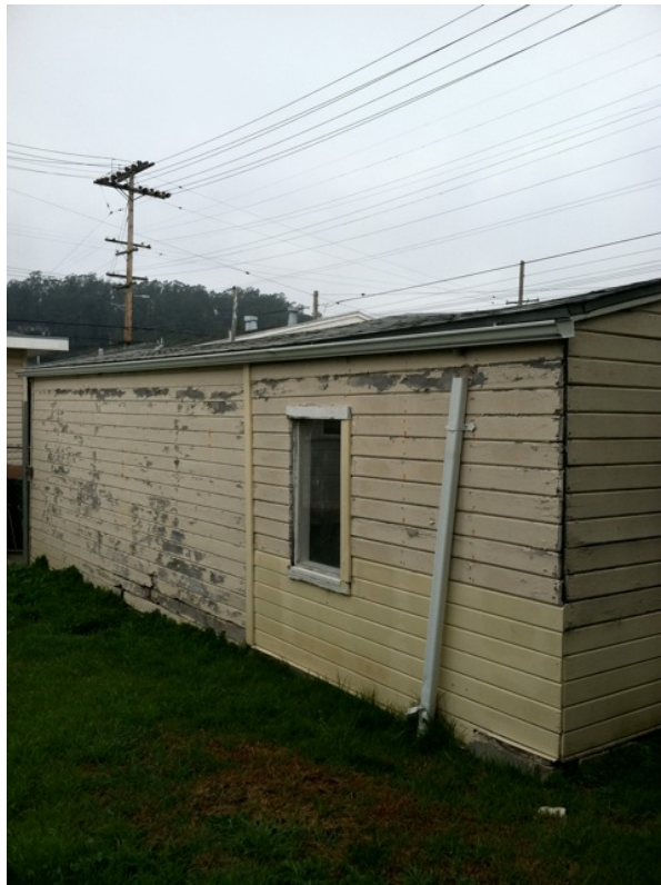
Photo 2. Dilapidated Garage