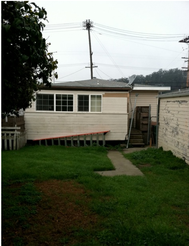
Photo 1. Illegal Rear Addition