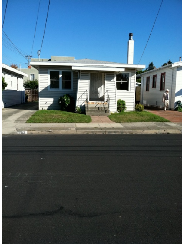
Photo 3. Existing Home

Previously, the applicants completed a similar renovation project for the home at 1014 Curtis St. in Albany. Upon selling that home, they purchased 703 Talbot with the intent of remodeling.