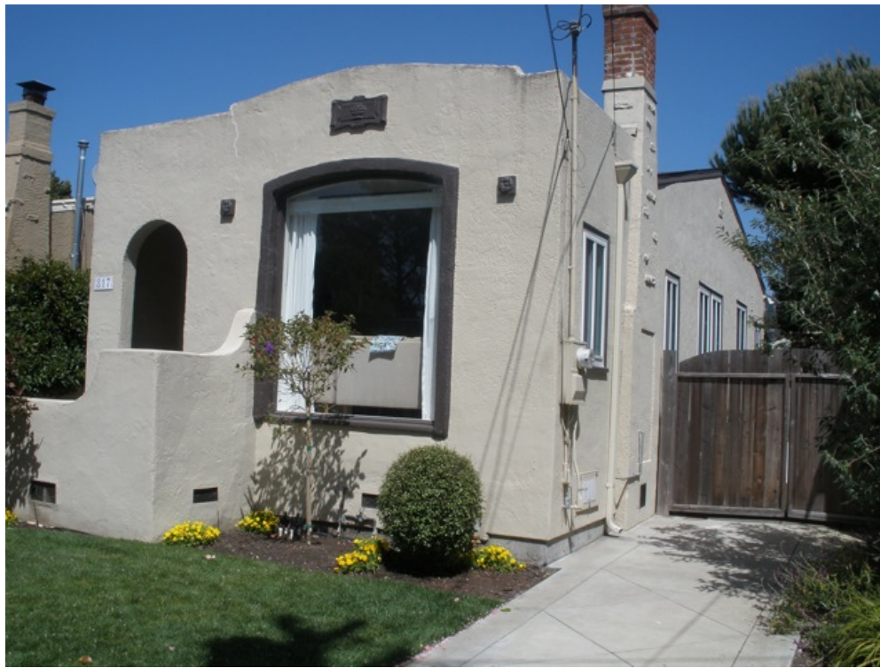
Photo 1. Street View of the existing home

A new deck is proposed at the rear of the home and will be accessible from the family room or dining room. The existing deck roof will remain. Additionally, the dining room on the first floor will be relocated and enlarged on the first floor to create room for the new stairway to the second floor.