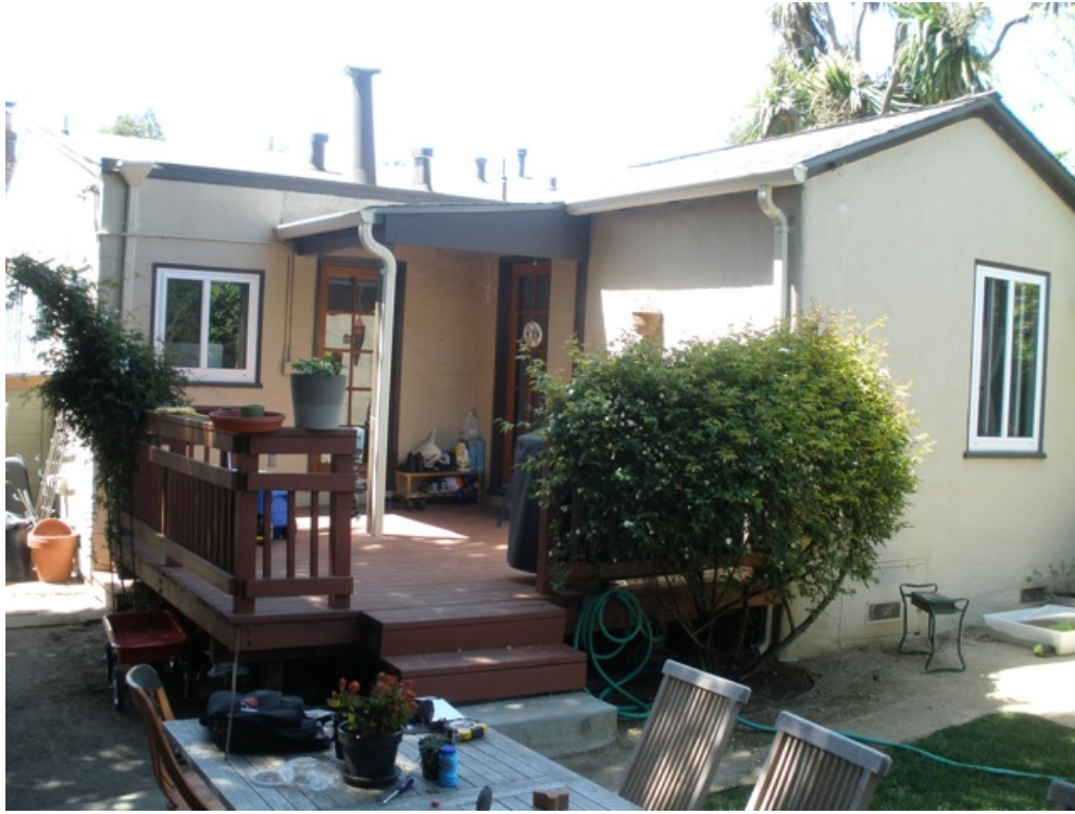
Photo 2. Rear of the Home