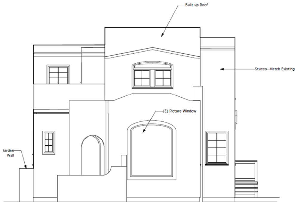
1 West Elevations--Proposed Scale: 1/4" = 1'-0"