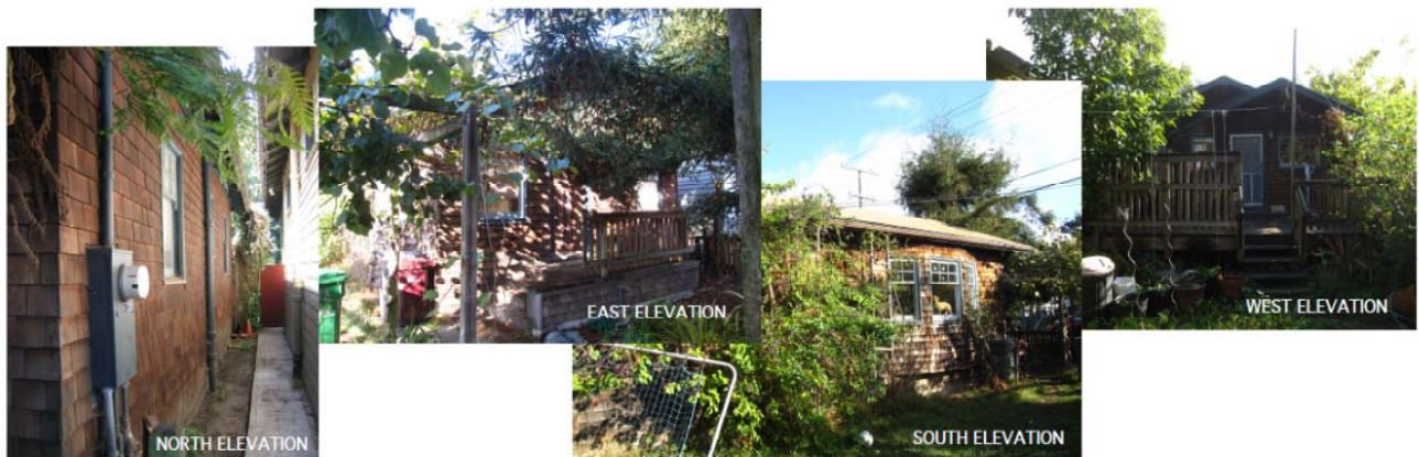
Picture 1. Existing Elevations

The existing residence is a single-story, Arts & Crafts style home with a low pitched-roof above the front door entry. There is a front gable roof for the entire residence. Exposed beams are featured on the east and west elevations. The existing home is clad in cedar shingle with green trim around the windows. The addition is setback approximately 20.5 ft. from the front elevation, and stacked at the rear of the home and will have a front gable roof to match the existing rooflines. The addition will be clad in board and batten on the south, west, and east elevations. The north elevation will be clad in cedar shingle to match the existing cedar shingle on the single-story elevation. There are two (2) existing storage buildings on the property which will remain on-site.