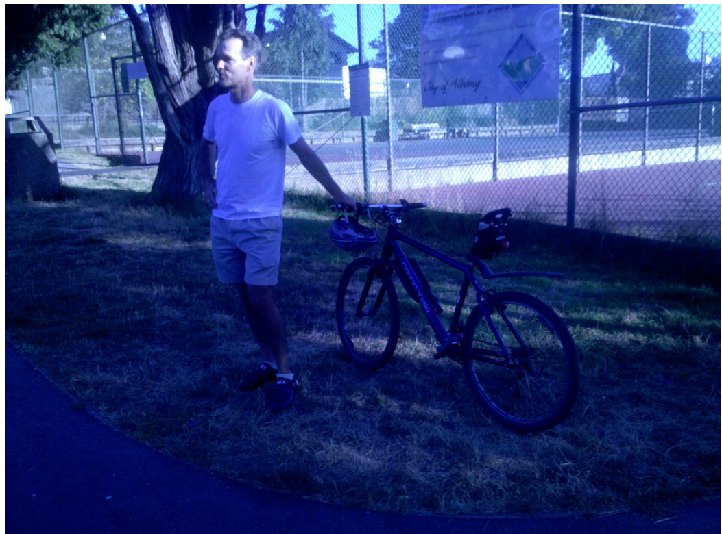
Tennis courts – 1 rack