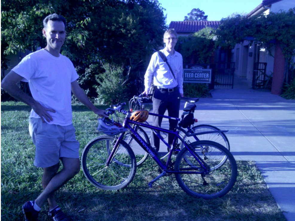
Teen Center – 2 racks