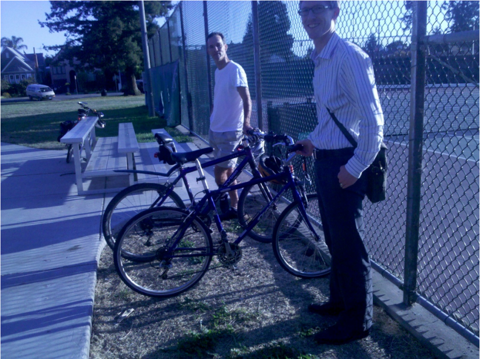
Tennis courts – 2 racks