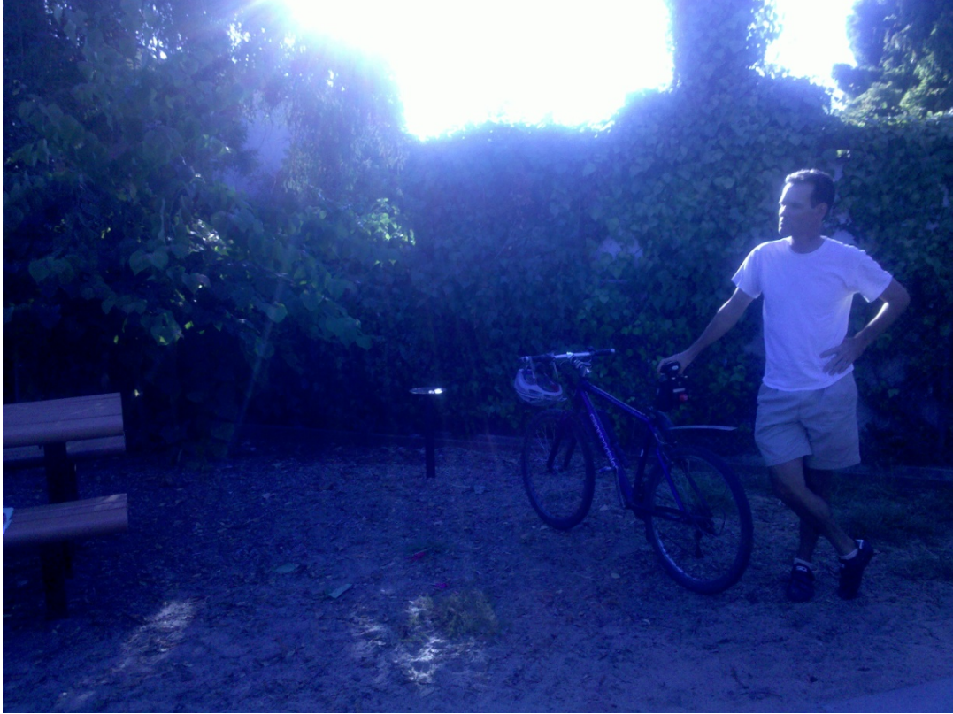
Playground – 1 rack