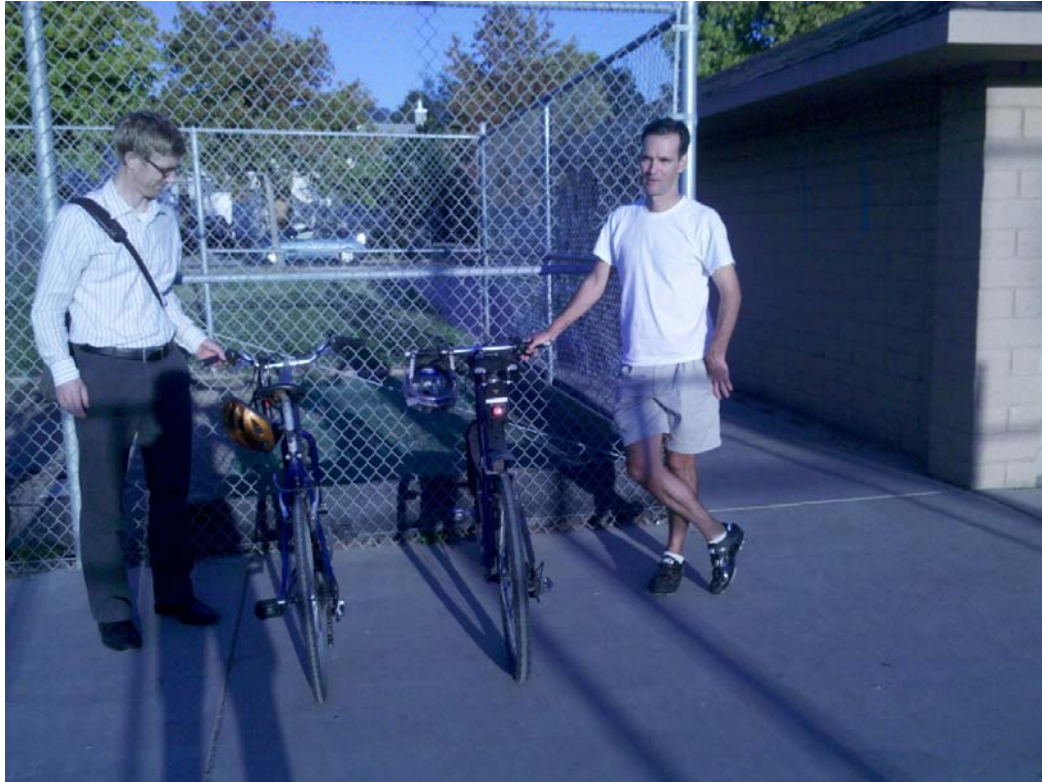
Ballfields – 2 racks