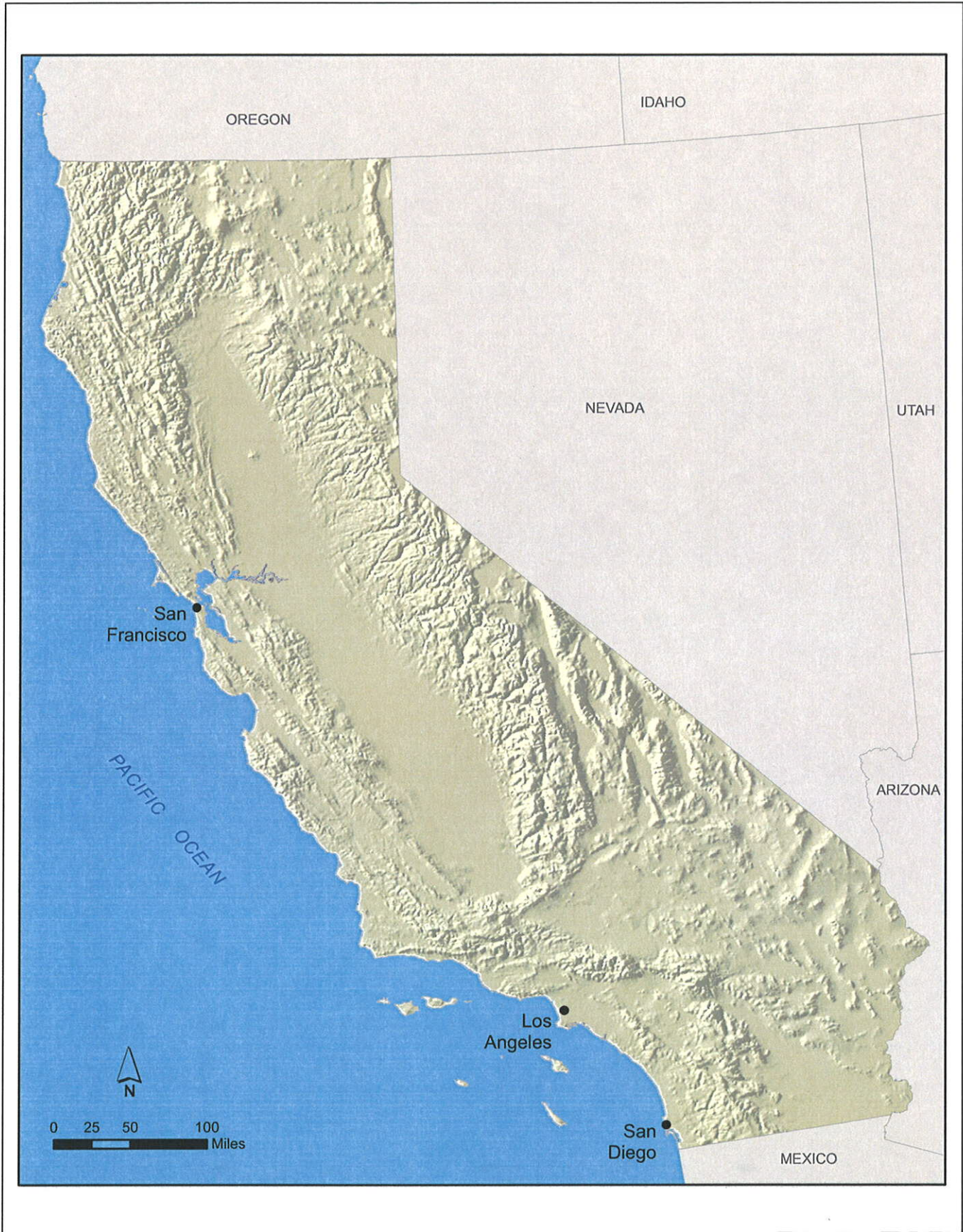
Figure 1 Program Area