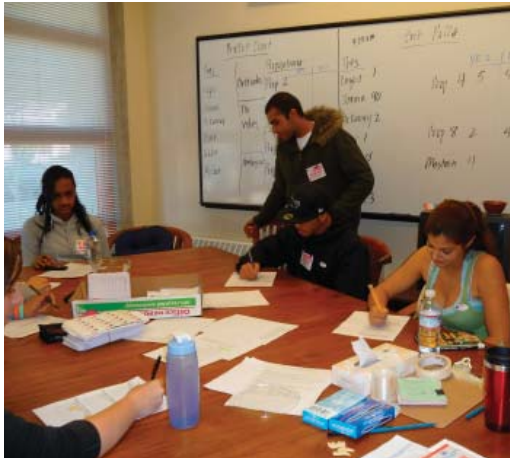
Connect students tally votes during the "Rock the Mock" election during Fall 2008, working with the League of Women Voters.