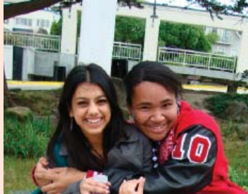
The haunts of author John Steinbeck and the Monterey Bay Aquarium are stops on a trip to Cannery Row.