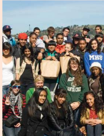
Students visit the newly opened Angel Island Immigration Station in Spring 2009.

Design Lab allowed students to design and create linocuts for book covers, illustrate their stories, and bind the books; this project followed initial explorations of design discipline and application. To better illustrate the connections between the arts and local history, a fieldtrip to San Francisco's Mission District was organized to see the Mission Dolores and participate in a City Walks tour of murals that illuminate the connection between culture and community. Finally, in a research-based project, students collaborated with Voices to Vision to redesign the waterfront or worked with local experts to propose a design for the Connect Garden and Compost Project; these proposals were judged by a panel that included Connect Academy partners.