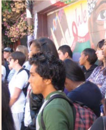
Juniors tour Mission Dolores and the murals and architecture of the surrounding neighborhood.