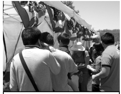
Business was brisk at the noon hour.