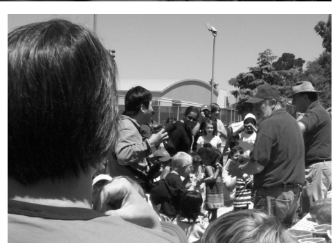
Watermelon eating contest—a favorite event at the Festival.