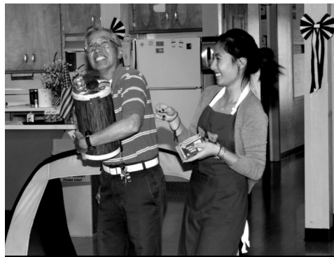
..And the rockets red glare....