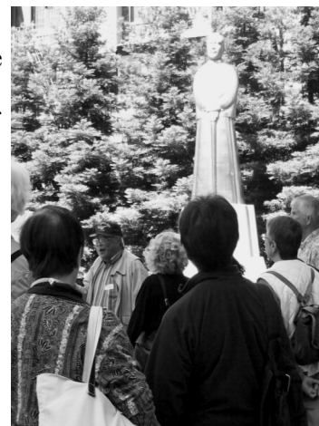
St. Mary Square, China-