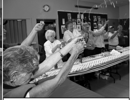
...Finally, the bombs burstin' in air....