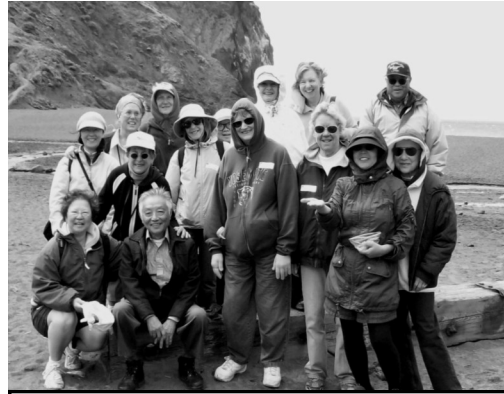
On windy Tennessee Beach.

The Tuesday trips are very popular--if you are interested in joining us, sign up for September's trips the begin-ning of August at the Center. (Each person will be limited to two hikes a month.) July hikes are wait-listed but you may put your name in. Our trips are fun and they are free.