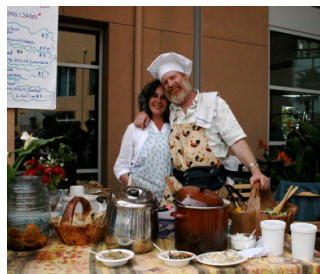
Passion Foods specialty vegetarian food Albany, CA