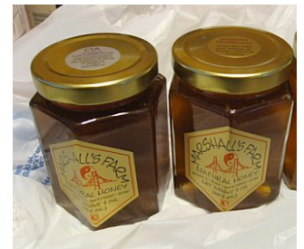
Marshall's Honey raw and kosher honey American Canyon, CA