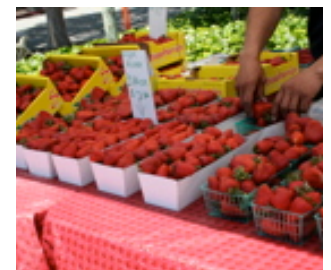
Berrylicious organic berries Gilroy, CA