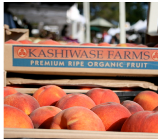
Kashiwase Farms organic stone fruit Winton, CA