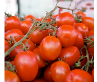
Blue Moon Organics organic produce Aptos, CA