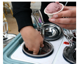
Scream Sorbet local whole ingredient ice cream Emeryville, CA