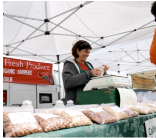
Francesca's Fresh Produce organic almonds and stone fruit Hughson, CA

*The pictures on the right are a small sample of our network of vendors.