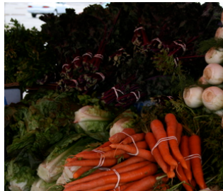
Nunez Farms organic produce Watsonville, CA