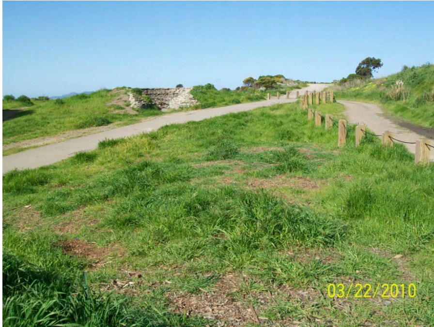
Albany Waterfront “Cove” Enhancement project Proposed landscape area located east of the “Cove” and west of pine trees (not pictured); Photo is looking west