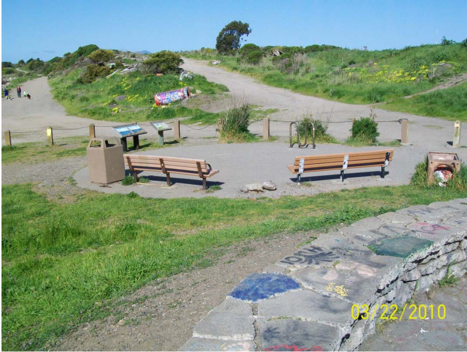
Albany Waterfront “Cove” Enhancement Project - Seating area looking west from Cove