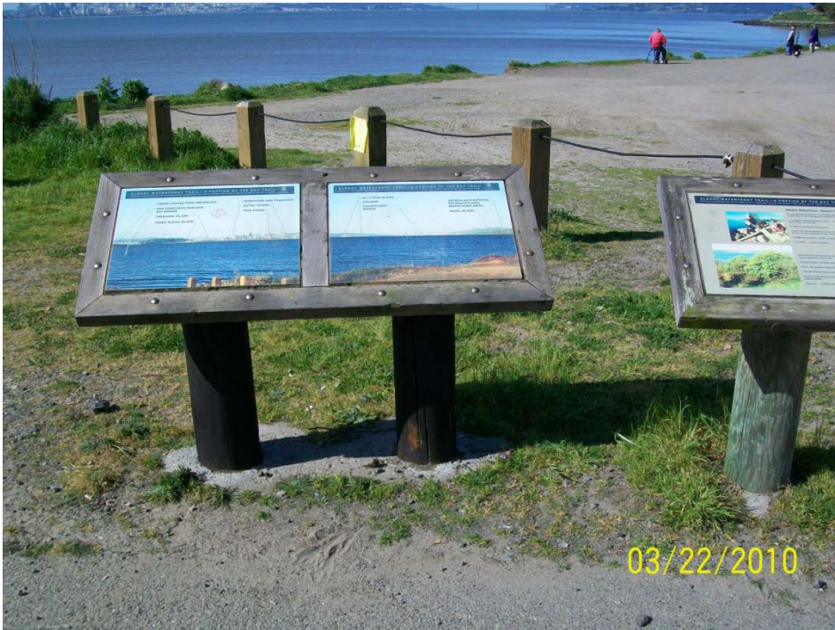
Informational plaques located near seating area looking west.