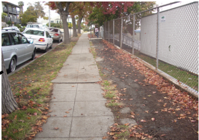
Replace and widen sidewalk along Curtis St. to comply with ADA requirements