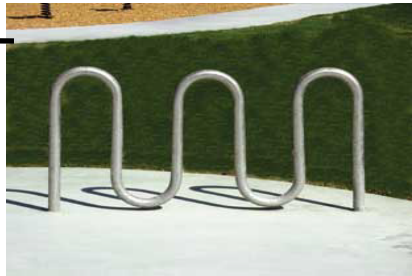
Install bike racks at the school