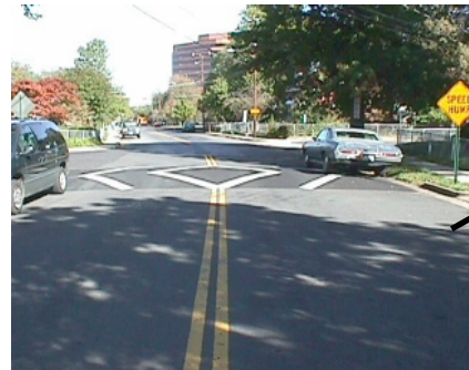
install a speed hump on the 1000 block of Santa Fe Avenue