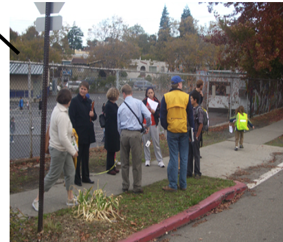
Remove existing unused driveway