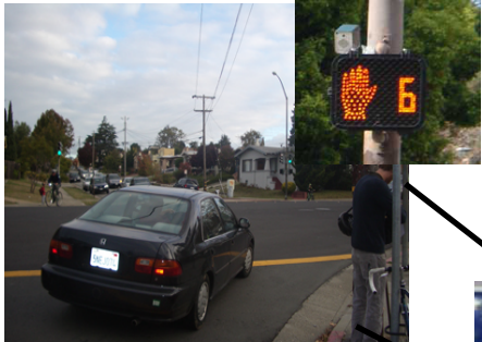
Replace existing signal at Marin and S. Fe intersection with new detector system and pedestrian count down heads