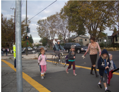
Move crosswalks closer to the intersection of Marin and S. Fe